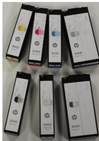
HP 3D400/450 Agent Cartridges