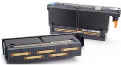
HP 3D600/710 Printheads