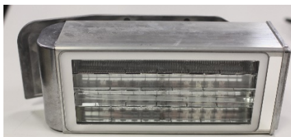
Lamp modules 1